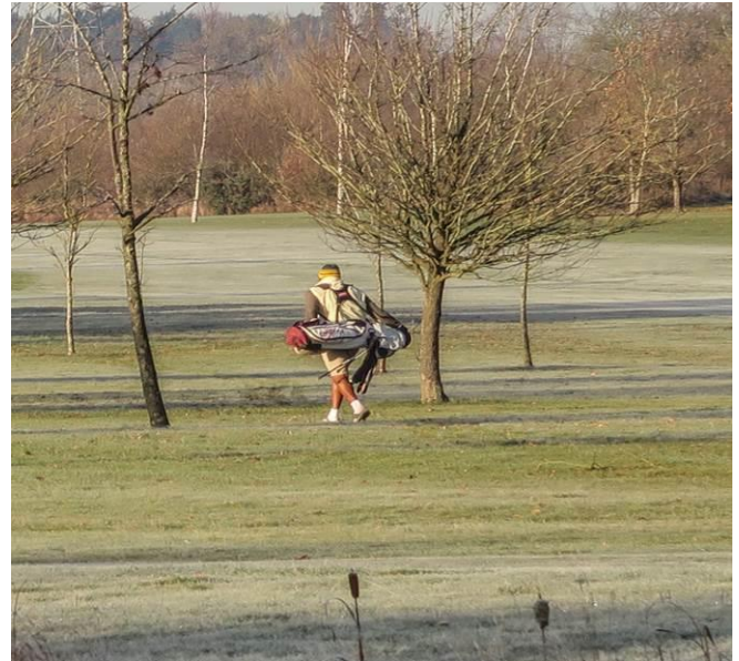
Figure 2 Is this the future of Henley Seniors? In sub-zero conditions bags are carried and shorts are worn. Ah, the foolhardiness of youth!