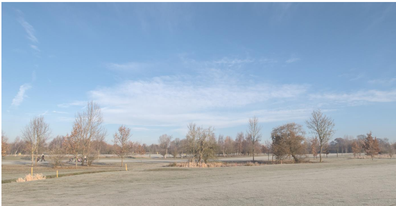
Figure 1 – A winter scene at Henley at the corner of the first fairway – how many senior balls have been lost in that ‘understated’ pond? Just the start you want in a qualifying competition!